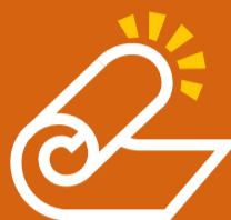
Cellulose/Paper/ Textile Chemistry