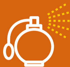
Flavor, Perfume and Cosmetic Science