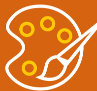
Paints, Pigments, Coating, Dye