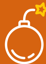
Explosives and Propellants